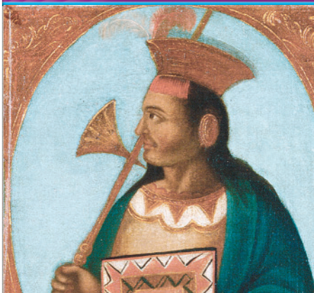
Pachacuti c. 1391–c. 1473

As the second son of the Incan ruler Viracocha, Pachacuti did not expect to succeed to the throne. However, when Cuzco was attacked in 1438, Viracocha and Pachacuti's older brother fled the city. Pachacuti stayed and drove off the attackers. He then proclaimed himself the new Incan ruler.